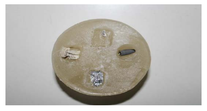
Figure 2: shows the PMMA phantom with materials used for analysis.

Figure 1 : shows the diagrammatic representation of the phantom with the representation of the four materials taken for study.