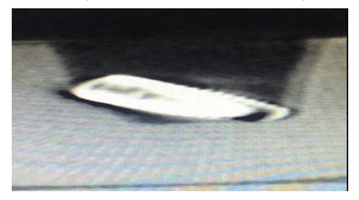
Figure 3 shows the CBCT reconstructed image of a dental implant placed in the phantom.

The reconstructed datas of CBCT were then imported as DICOM (Digital Imaging and Communications in Medicine) files via the OnDemand3D software v1.010.7510 (Cybermed Inc., Korea). The gray values were rescaled by the software to ensure the same method of analysis of the data and to avoid errors created due to various software applications. To calculate the mean gray values, 10 regions of interest (ROI) were used. (Figure 3)