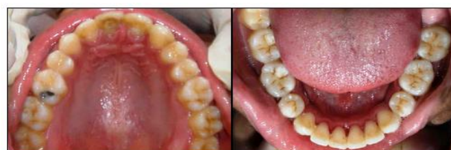
Maxillary Occlusal View