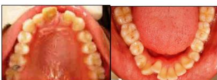
Maxillary Occlusal View Mandibular Occlusal View