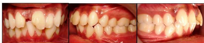
Frontal View Left Lateral View Right lateral View