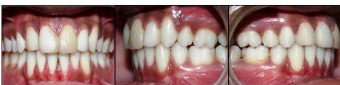
Frontal View Left Lateral View Right lateral View