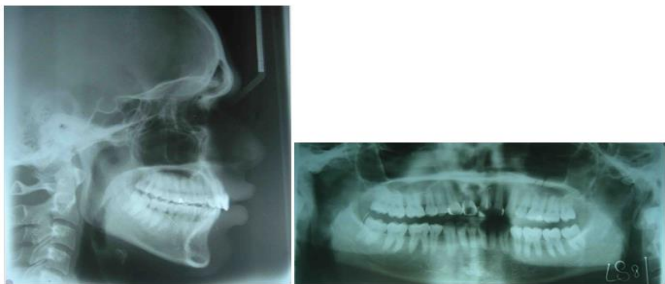
Figure 3 C: One year Post Treatment Radiographs