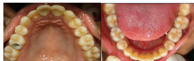
Maxillary Occlusal View