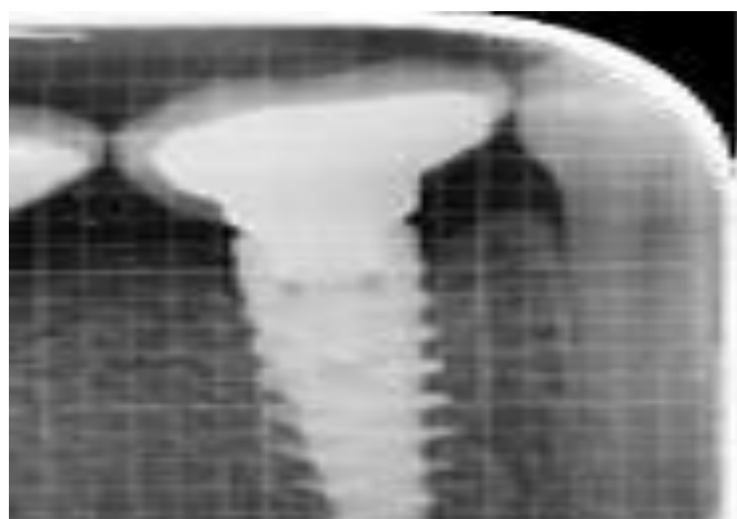
Fig 6: IOPAR with grid for crestal bone evaluation after 6 months