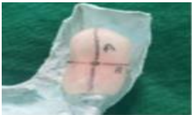
Fig 3: Diagnostic cast and Surgical Stent