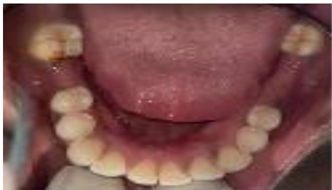
Fig 1: pre-operative photograph of the edentulous site