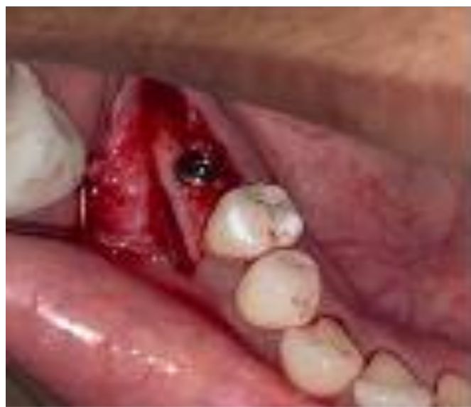
Fig 5: Cover screw tightened after implant placement