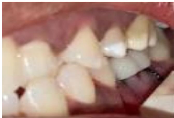
Fig 4: Provisional Restoration in occlusion