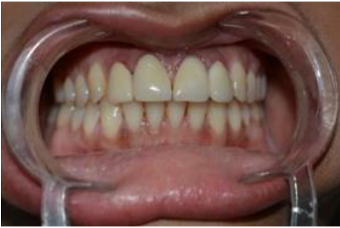
Fig.7: Bisque Trial