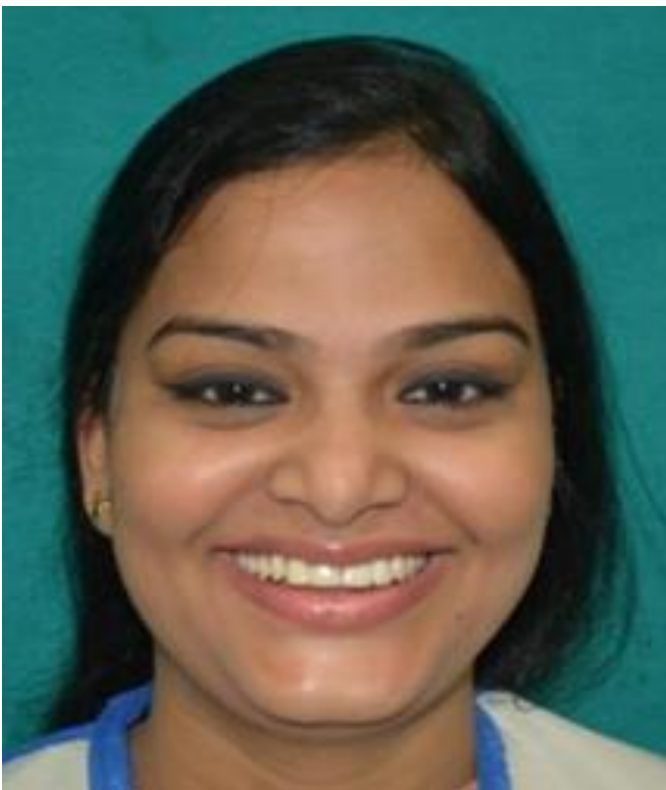
Fig.9: Esthetic Smile.