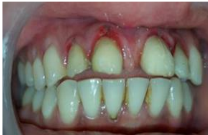
Fig.4: Teeth Preparation