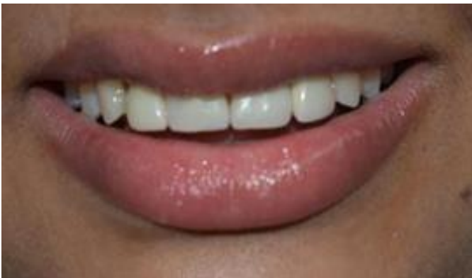
Fig.8: Final Prosthesis