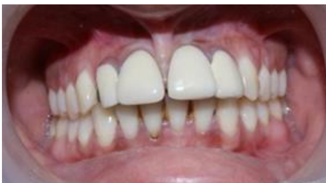
Fig 2: Pre-Operative Intra Oral Photograph.