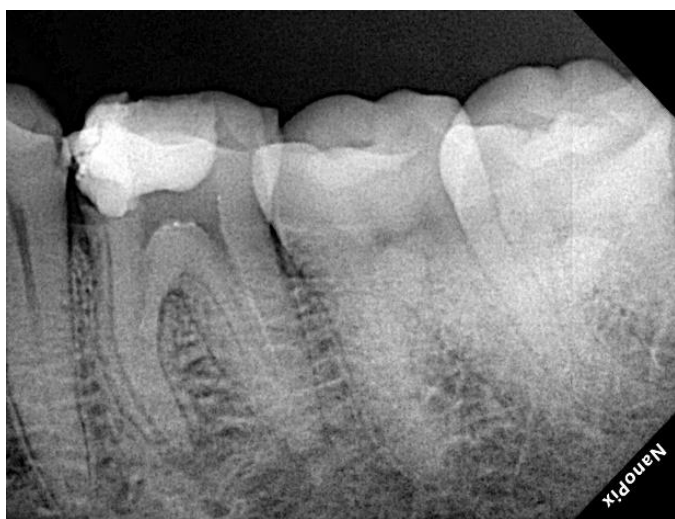
Figure 2: Master cone radiograph.