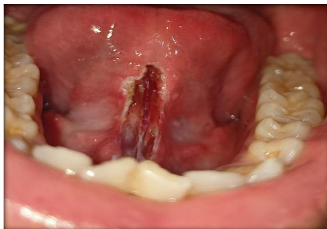
Figure 5: Completion Of Frenectomy By Laser