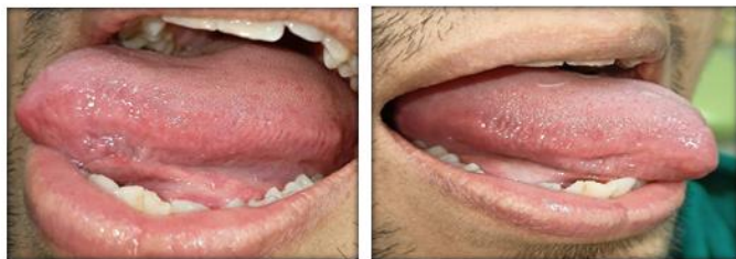
Figure 3: Pre-Operative Left & Right Lateral Views