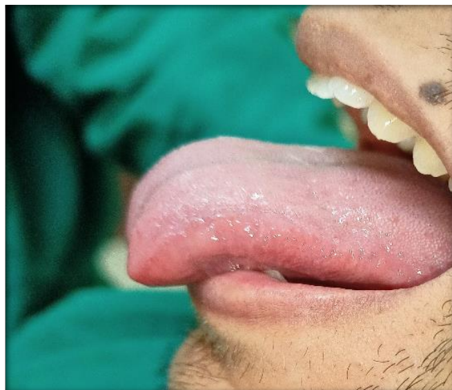
Figure 6: Protrusive Tongue Movement Being Checked During Procedure