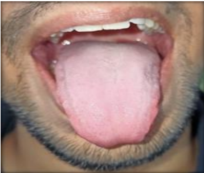
Figure 8: Postoperative view 3 months (Frontal View)