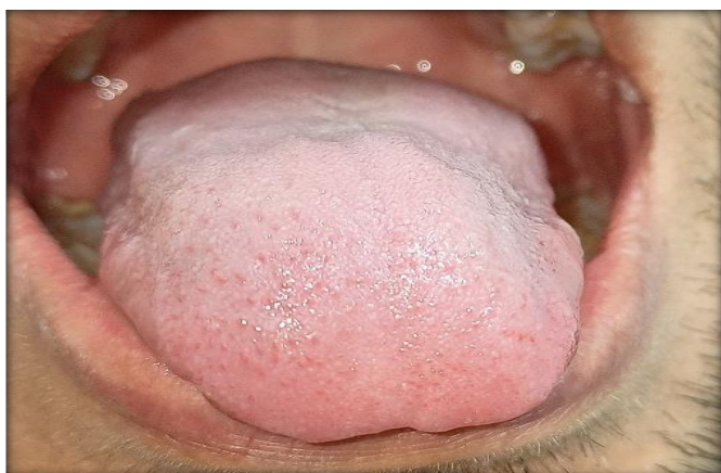
Figure 2: Pre Operative Frontal View