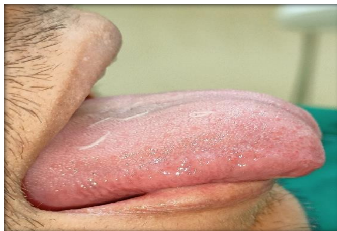
Figure 4: Pre Operative Maximum Protrusion