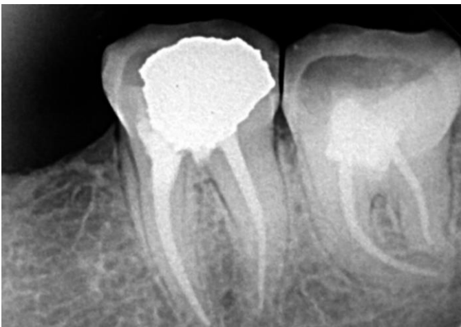
Figure 1 D: Post Obturation Radiograph