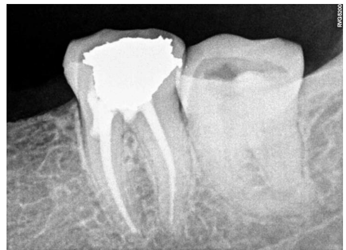
Figure 1 A: Pre-Operative Radiograph

Thus, successful management of severely curved root canal requires careful preoperative assessment, sequential use of appropriate hand/rotary instruments, adequate glide path preparation and frequent irrigation. The degree of canal curvature acts as a guideline for treatment planning in these cases.