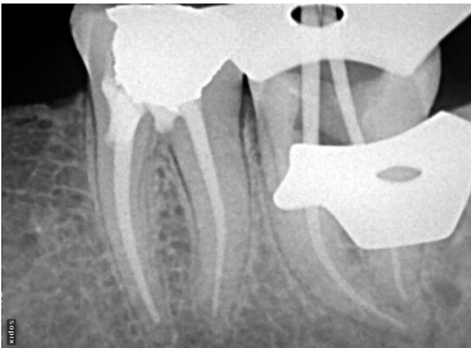
Figure 1 C: Master Cone Selection Radiograph