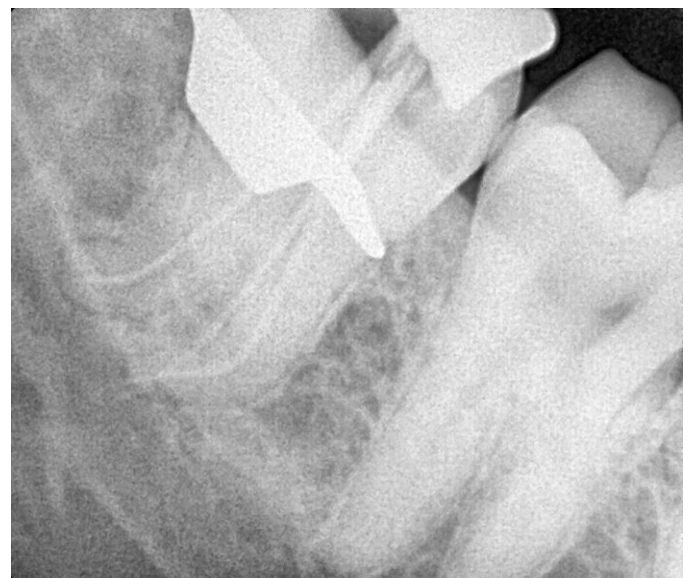
Figure 2 C: Master Cone Selection Radiograph