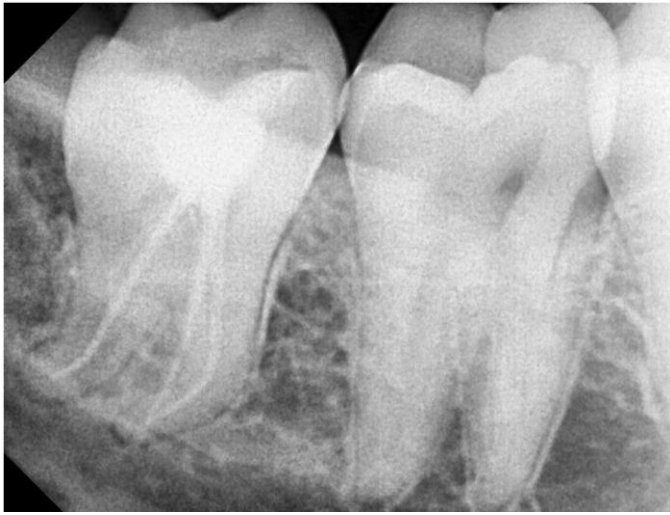
Figure 2 D: Post Obturation Radiograph