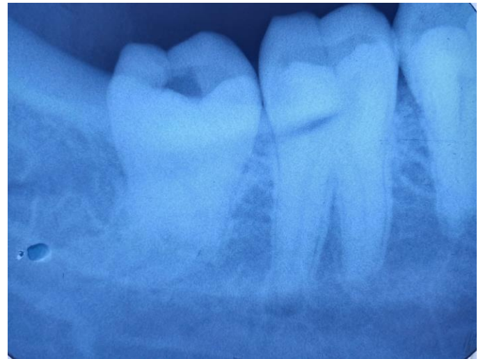
Figure 2 A: Pre-Operative Radiograph