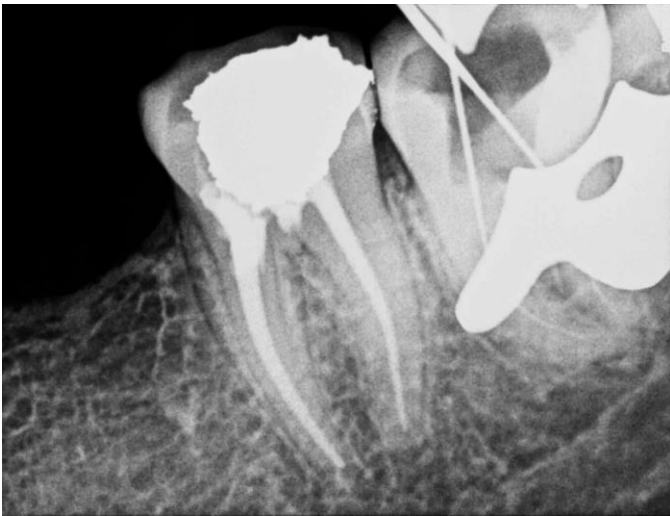
Figure 1 B: Working length Radiograph