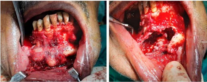
Figure 4: Intra Operative View