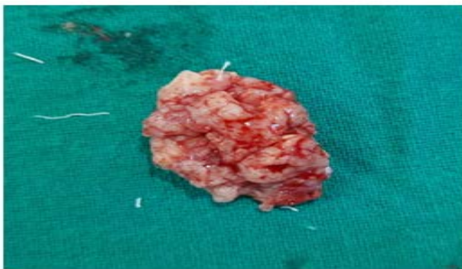
Figure 5: Excised Pathology