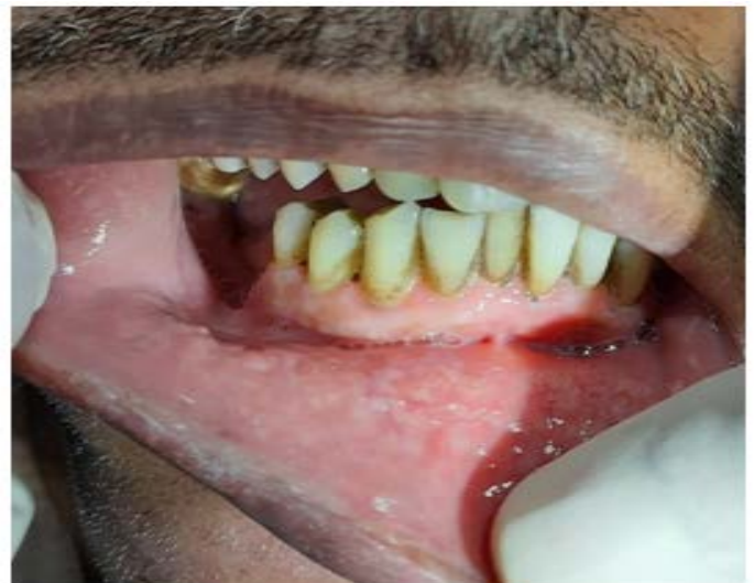
Figure 2: Preop Pic (Intra Oral View)