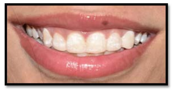
Figure 4. Intraoral view of composite mockup