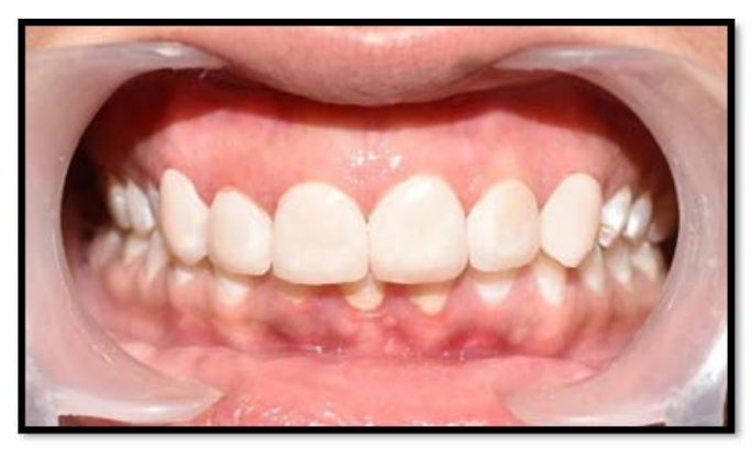
Figure 8: Composite Temporaries cemented