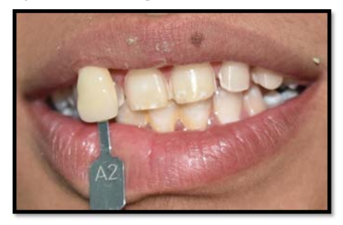
Figure 6: Shade Matching