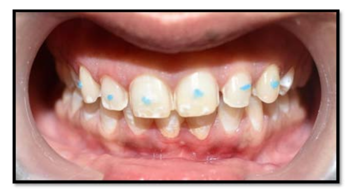
Figure 7: Spot Etching done before temporization