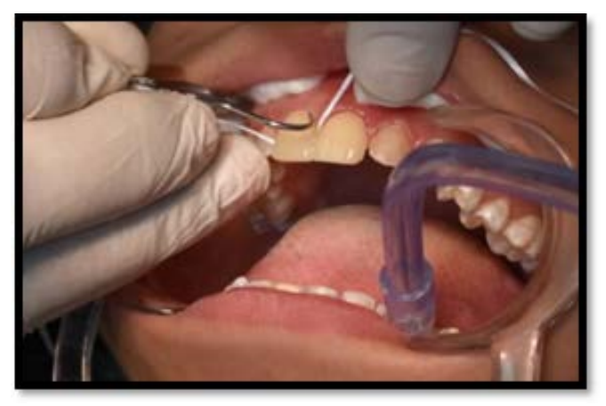
Figure 13: Cementation