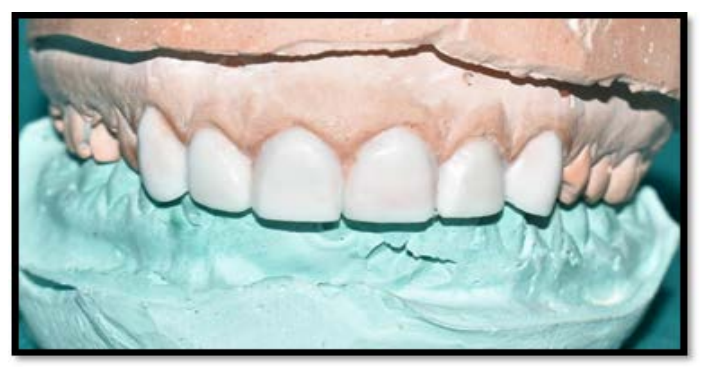
Figure 2: Diagnostic Waxup