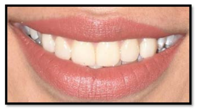
Figure 14: Post operative view