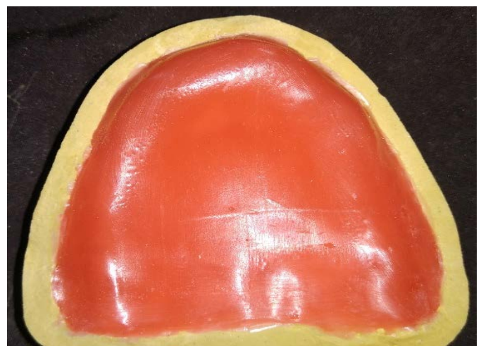
Fig 1: A layer of wax adapted on Master cast

Maxillary master impression was obtained after border molding with green stick compound (DPI Pinnacle, Mumbai). Modelling wax (Y-DENTS Modelling wax no. 2, MDM corporation, Delhi) was adapted (Fig 1) and flaked with Heat-cured acrylic denture base resin (ACRYLIN- 'H', Asian Acrylates, Mumbai). Thus fabricated denture base simulates maxillary denture without teeth. Then, a stainless steel hook was attached to centre of maxillary denture base on polished surface with chemically cured resin which facilitates to secure a nylon thread (Fig 2). Denture bases were stored in water until used.