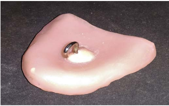
Fig 2: A hook attached in the center of maxillary denture base

The specially designed retention testing instrument was based on the device used by Stromberg and Hickey. [12] The vertical force required to dislodge maxillary denture base was measured. Retention testing instrument had a base, a vertical stand, horizontal arm with chin rest and a dislodging rod with pulley. The horizontal arm was above and perpendicular to the vertical stand and consisted of adjustable chin rest. The dislodging rod was attached above the horizontal arm, parallel to it and consisted of three pulleys. The narrow diameter of dislodging rod with pulley facilitated insertion into oral cavity. A nylon thread was secured to the pulleys and the other end of which was attached to Digital Force gauge (Lutron FG 5000 A) which measured dislodging force in Newton.