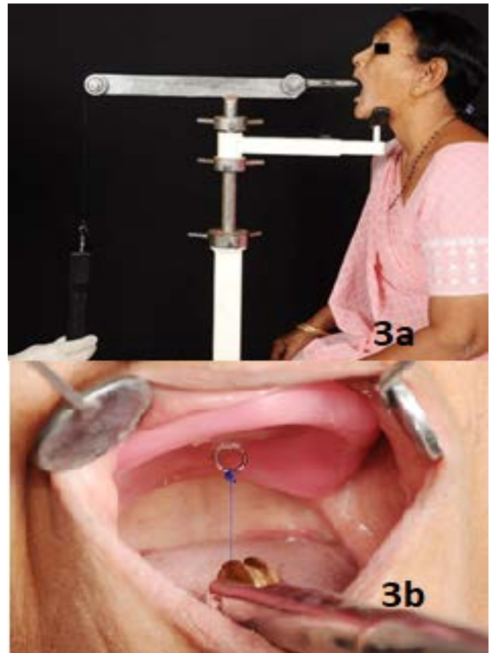
Fig 3a and 3b: Retention testing in patient

marked on the tip of nose and the chin during testing. The thread was passed over pulleys and attached to the Force gauge which measured dislodging force in Newton (N). Such position ensured that dislodging forces were perpendicular to the denture base. One-minute time was allowed for complete adaptation of denture base to palate. Three consecutive readings were taken and mean dislodging force was recorded for denture base before sandblasting.