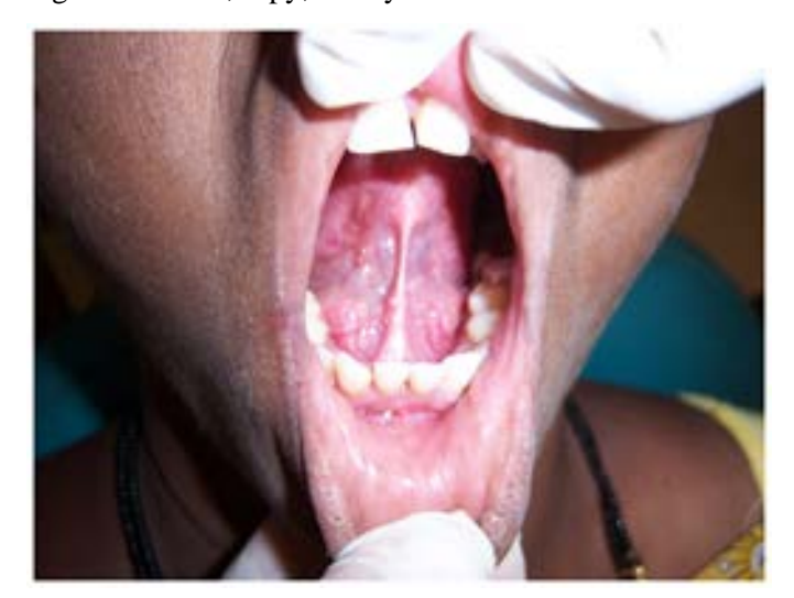
Figure 5: Absence of salivary pool in the floor of the mouth