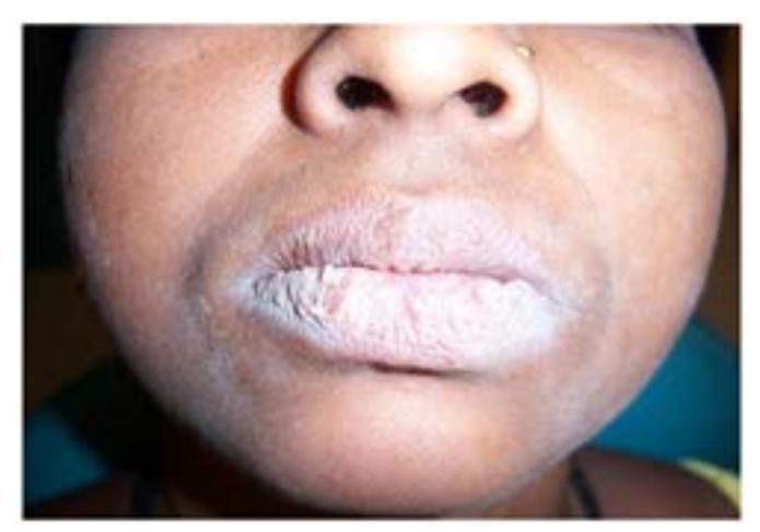
Figure 2: Dry and cracked lips