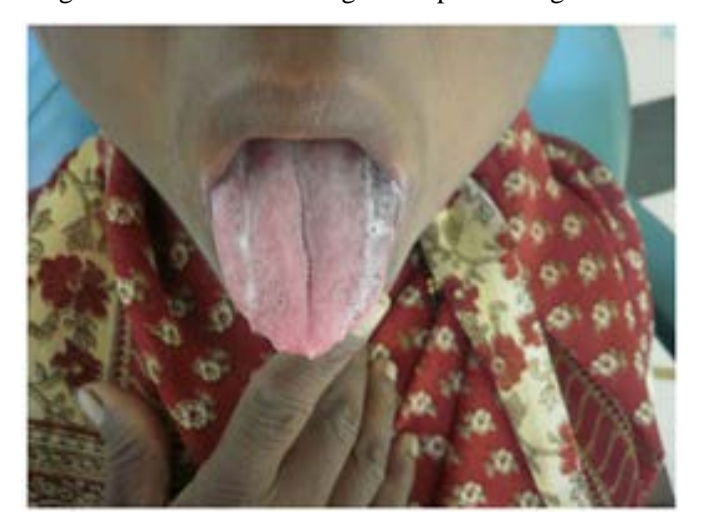
Figure 4: Thick, ropy, scanty saliva