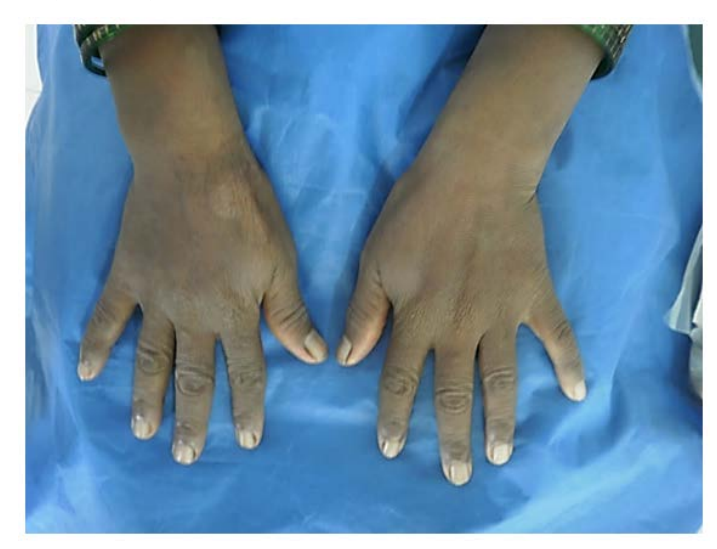
Figure 1: Swelling over small joints of hands