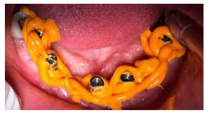
Figure 14: Impression making- For impression (Rubber base impression material)