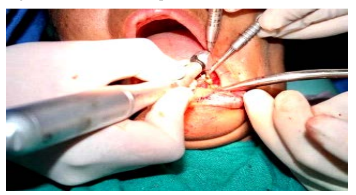
Figure 7: Initial drill in position