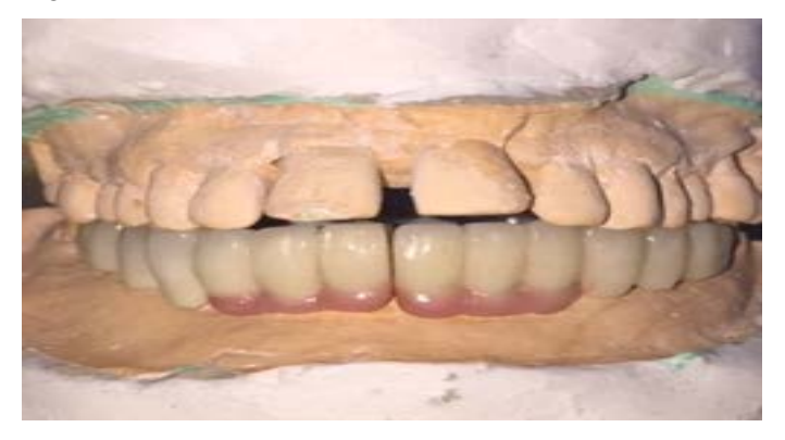
Figure 16: Ceramic build up was done