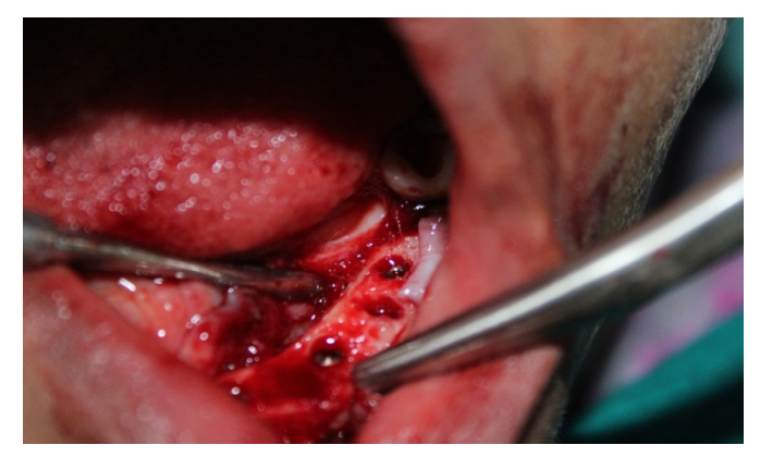
Figure 8: Before placing the cover screws