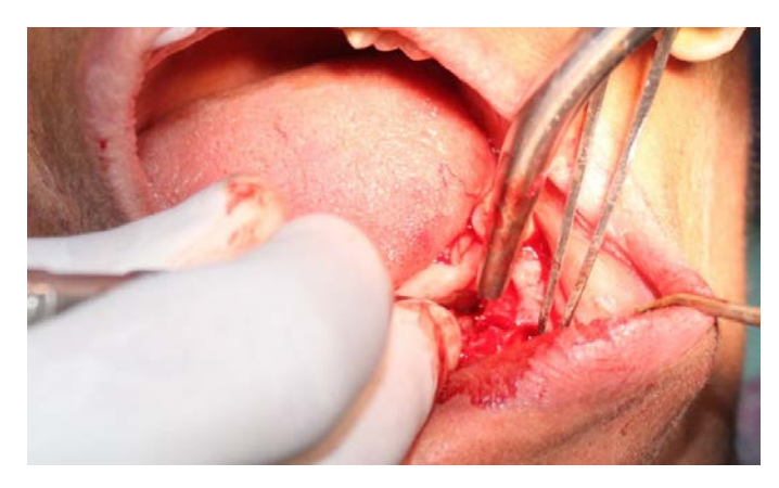
Figure 6: Incision and Flap Reflection

A crestal incision in the keratinized gingival layer extended by two small releasing incisions in the posterior areas enables us to carefully uncover the mental foramen, which is the major anatomical bodies in this zone.Crestal bone osteoplasty and flattening procedures were carried was out in edentulous knife-edge ridge to restore bone width before implant placement. Two implants were inserted in site 32 and 42 and four implants in posterior region (34-36 and 44-46). In 32 and 42 region, 3.75 \times 10.5mm implant was placed. In 34 region 3.75 ×10mm implant is placed. In 44 regions 4.2 \times 10 mm implant was placed and in 36 and 46 regions 4.2×8mm implant was placed. Paralleling tools were placed and checked for angulations of the implant. Sequential drills were used and implants were placed in the osteotomy site and wrenched into the site until all threads were buried. After that cover screws were placed and suturing was done.