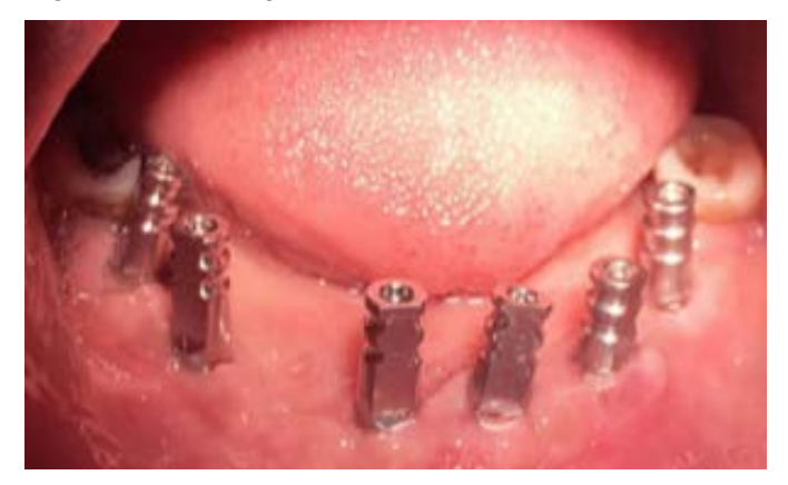
Figure 13: Impression coping to the implant