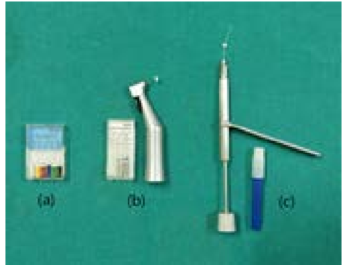
Fig 1: Three Obturation Systems : (a)Reamer, (b)Lentulospiral And (c)Endodontic Pressure Syringe

Group III: Obturation using Endodontic Pressure Syringe