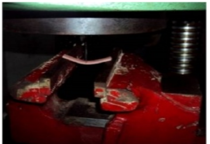
Figure 4: 3 point bending test in UTM

Measurement of flexural strength of samples was tested by using a three-point bending test in an INSTRON universal testing machine(Figure 4).