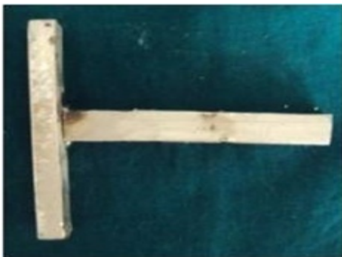
Figure 2: Metal die for adjusting thickness of flexural strength and hardness samples

Trimming was done by using rotary burs, and the thickness of the sample was reduced by using special jig (Figure 2), which holds the samples, and around 10 strokes were used in a single direction. 200 and 400 grit waterproof emery paper were used for finishing the samples. Polishing was done by using a rag wheel and pumice. According to ADA specification 12 the dimensions of samples are 65 mm length, 10 mm width, 2.5 mm thickness.