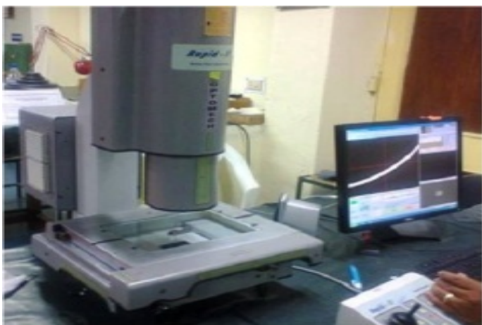
Figure 6: Video inspectory system

raise of samples in the central palatal portion on metal die. The values were obtained in mm.