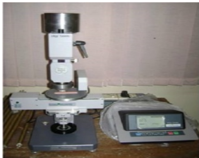
Figure 5: Shore D Durometer

Measurement of the hardness of samples was tested by using the shore D microhardness testing machine(Figure 5). In the present study, the samples were placed on the surface of a metal table. Three lines were marked on the surface the specimen which faced the operator, one at the middle (at 32.5 m.m. length from either end of sample), and two at each ends 5mm from the edge of the specimen.