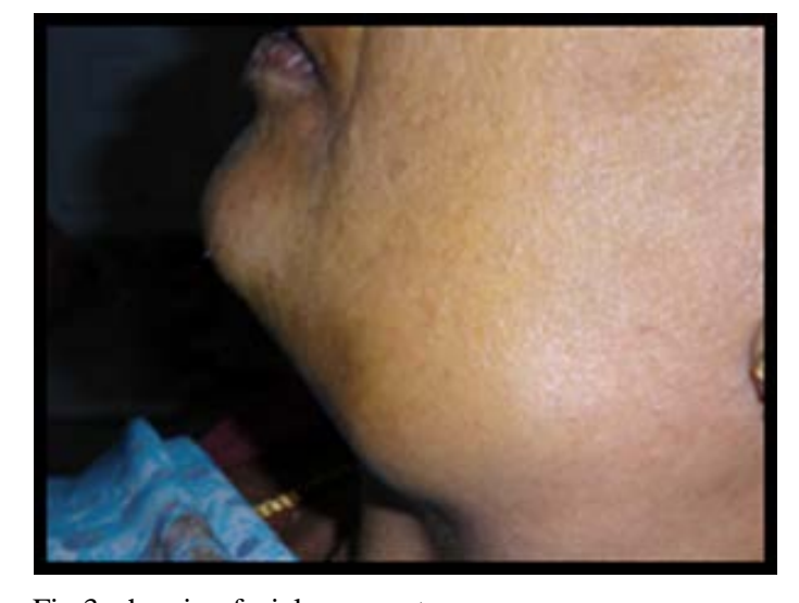
Fig 3: showing facial asymmetry