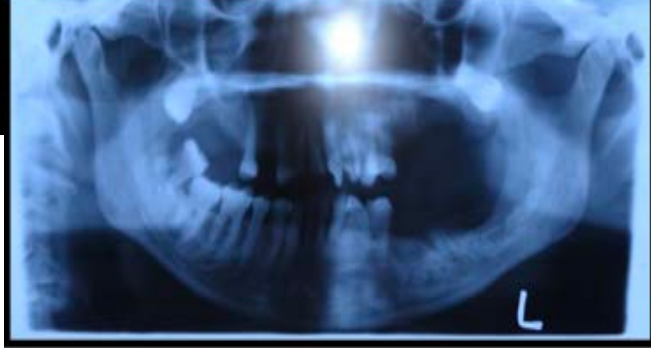
Fig 5: Orthopantomogram revealing generalised periodontitis