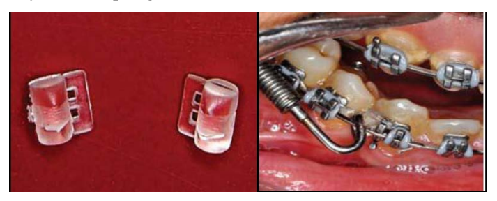
Figure 9: Rotational wedges and their placement