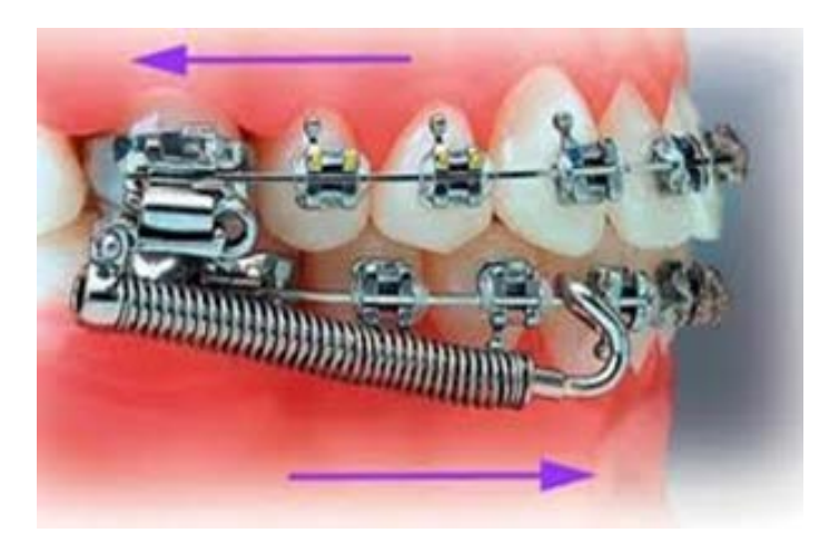
Figure 1: FORSUS (Fatigue resistant device)

Forsus springs work best in any Class II cases with convex profiles, except those with normal mandibles and prognathic maxilla, or with protrusive or overly large mandibles relative to the other skeletal structures. In comparison with other appliances its great advantage lies in its NiTi coil spring providing resistance to breaking. It is available in different spring length sizes like 28 mm, 31 mm, 34 mm and 37 mm for left and right side. Its bent ends helps the spring to attach to bands and archwires of the previously placed fixed orthodontic appliances. There is no interference with continuous arches used during the treatment, which offers wide application independently of the method applied. The appliance slides along the arch and facilitates opening of the mouth and lateral movements and thus allowing the patient to open and move their jaw freely. Its availability in different sizes, various attachments and stops gives an orthodontist the power to control the amount of force. To select the length of coil spring to be used, measurements are made in habitual occlusion from mesial of headgear tube of the upper first molar to distal of the lower canine bracket. 12 mm is added to this measurement (4 mm play, 4 mm headgear tube, 4 mm activation) and this gives the length of the module to be used. The assembly has a ball pin and a ball stop, the earlier one serves to attach it to headgear tube whereas the later one acts as a stop for the appliance