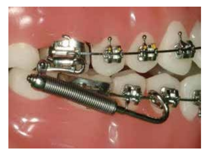
Figure 8:Overactivation results in push rod being pushed beyond the spring on centric occlusion