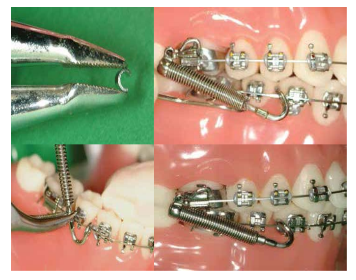
Figure 7: Reactivation of appliance