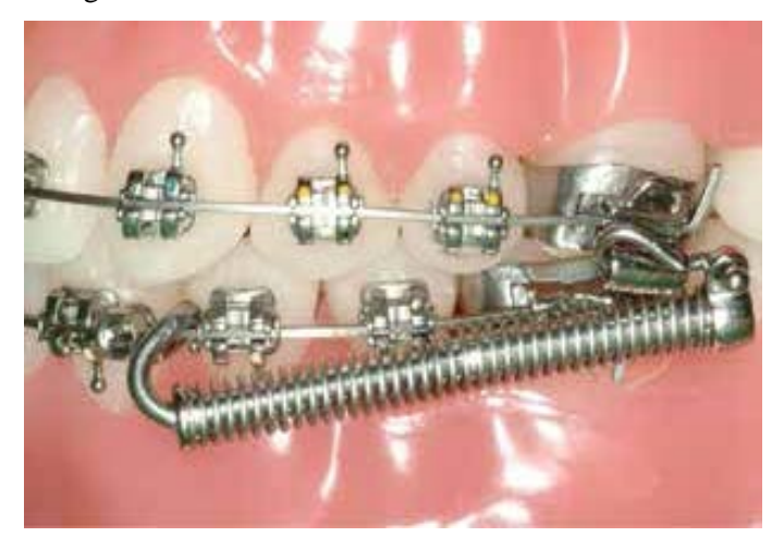
Figure 4: Gurin lock

help. Appropriate length of push rod should be selected with FORSUS guide scale (Figure 5). Push rod loop is to be placed between canine and first premolar, have patient open mouth, compress spring and insert the push rod through it.