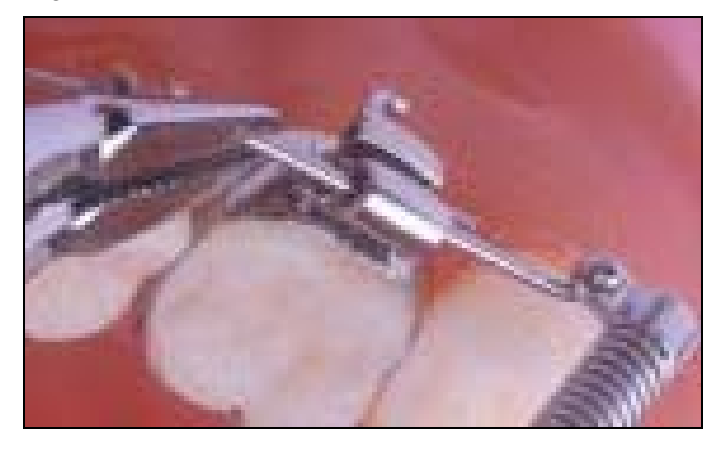
Figure 2: L ball pin inserted from distal to mesial in headgear tube

Insert 'L' ball pin into spring module's distal end pin hole and pull it through headgear tube from distal to mesial end (Figure 2).