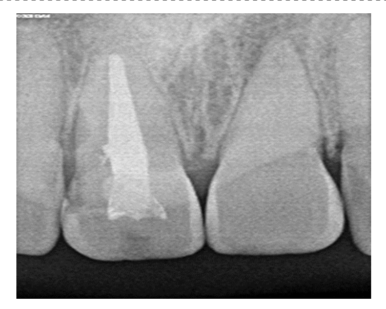
Review radiograph after 6 months.

Clinical photograph of palatal view tooth #11 shows the resorptive lesion after surgical exposure. The resorptive defect sealed with biodentine.