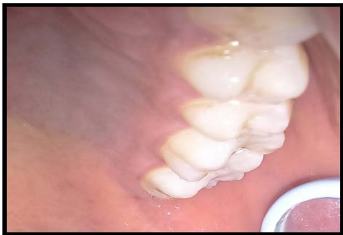
Figure 2: Intra oral view :showing a sharp mesiobuccal cusp of maxillary second molar.