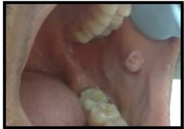
(B) Intra oral view: showing a nodular growth on the left buccal mucosa in line of occlusion.