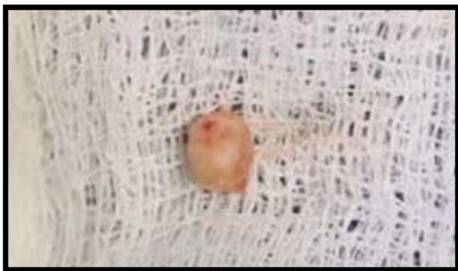
Figure 3: On gross examination the excised tissue was creamish in colour, round shaped, soft in consistency measuring about 6mm x 7mm x 5mm in size.