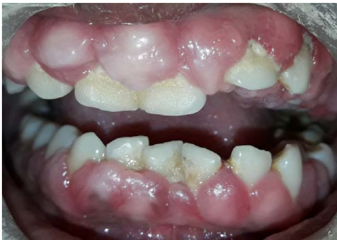
Fig. 2: Gingival enlargement noted on buccal aspect of upper and lower anterior teeth.