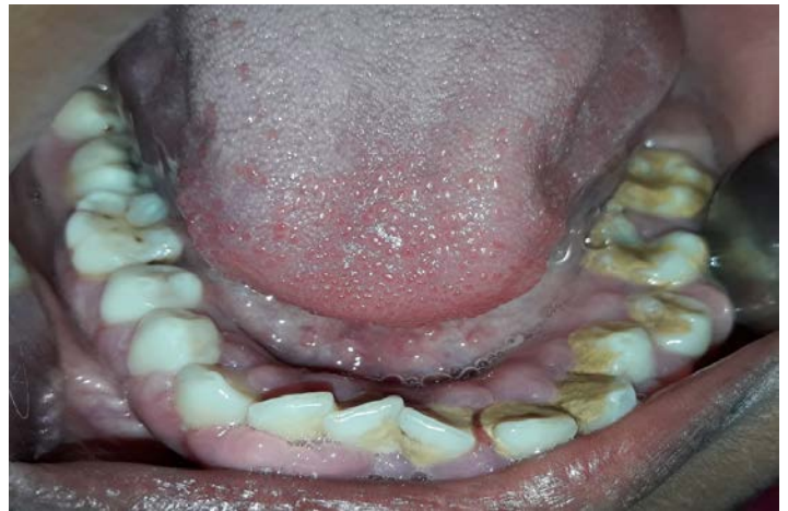
Fig.4: Unilateral gingival enlargement noted on left lower posterior teeth.