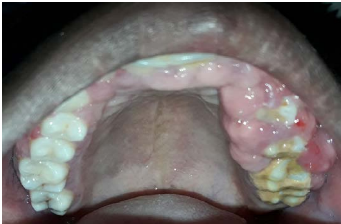
Fig.3: Unilateral gingival enlargement noted on left upper posterior teeth.