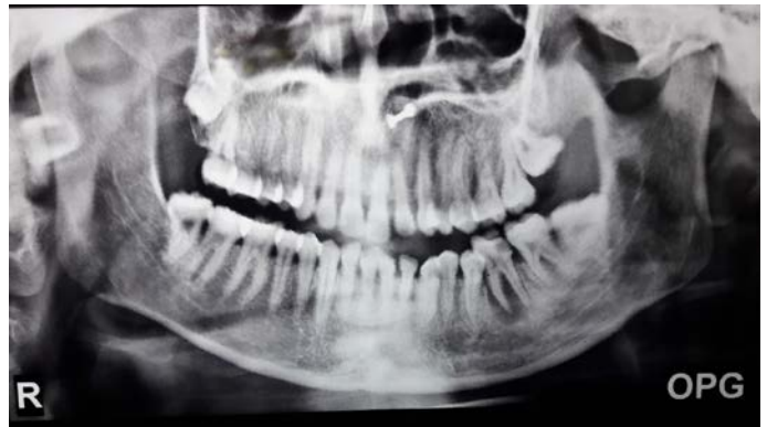
Fig.5: OPG of the jaws