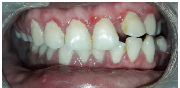
Fig.6: Post op intraoral view of the patient