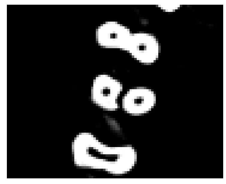
Fig 3 a