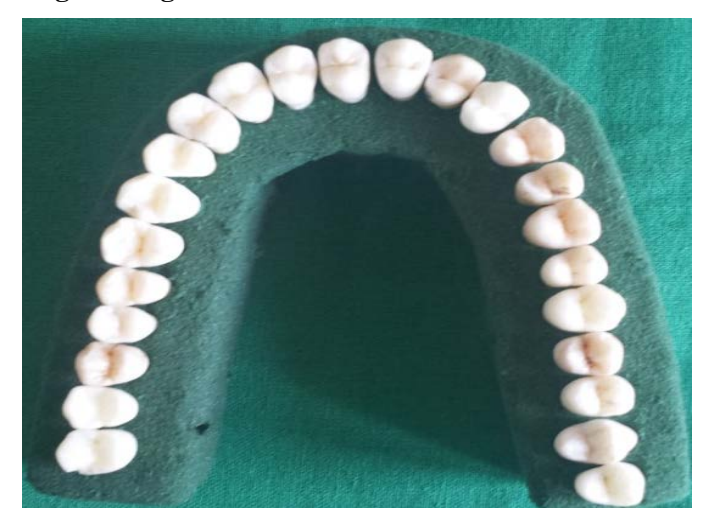
Fig 1 : samples arranged in template