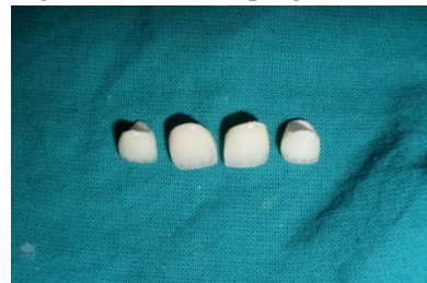
Fig 9: Layered Zirconia Crowns