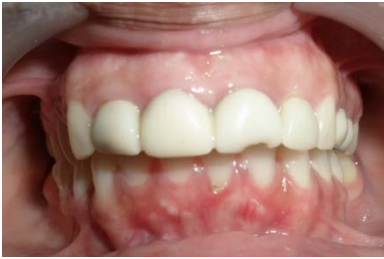
Fig.1:Pre Operative – Frontal View