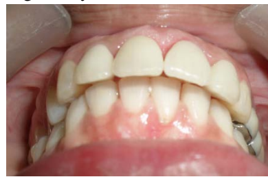
Fig 10: Proper Centric Stops