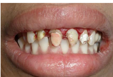
Fig.5: Amount of Tooth Exposed Post Crown Lengthening 12-22