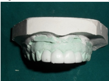
Fig.3: Wax Up 12-22