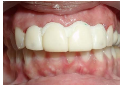
Fig. 6: Relined Provisional Prosthesis