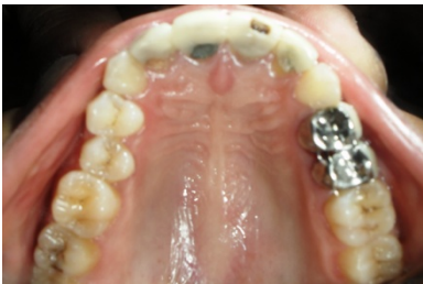
Fig.2: Occlusal View-Maxillary Arch