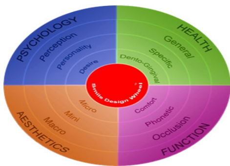
Figure 1 : The Smile Design Wheel For any smile design procedure, the clinician needs to consider the elements of the smile design—Psychology, Health, Function And Aesthetics [4]

technique is used for veneering zirconia framework with compatible ceramics. [3]