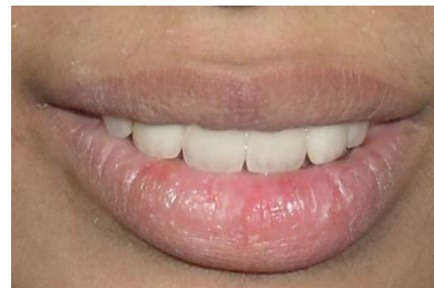
Fig. 11: Final Luted Crowns With New Smile