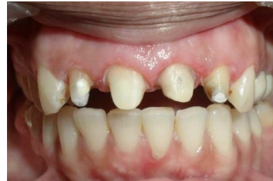
Fig.7: Tooth Preparation 12-22 up to new gingival margin