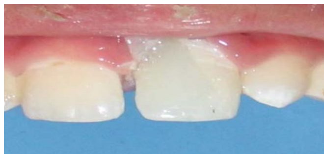
Fig. 5: Composite build up with 21