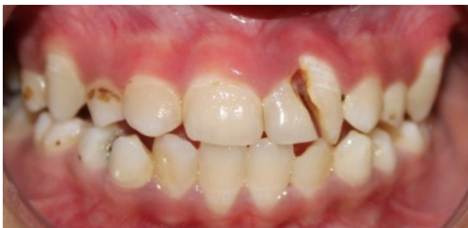
Fig.1b: Intraoral buccal view