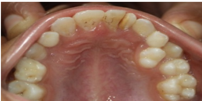
Fig.1c: Intraoral palatal view