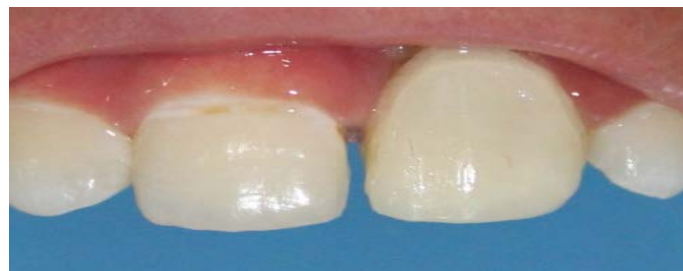
Figure 6: Polycarbonate crown placement