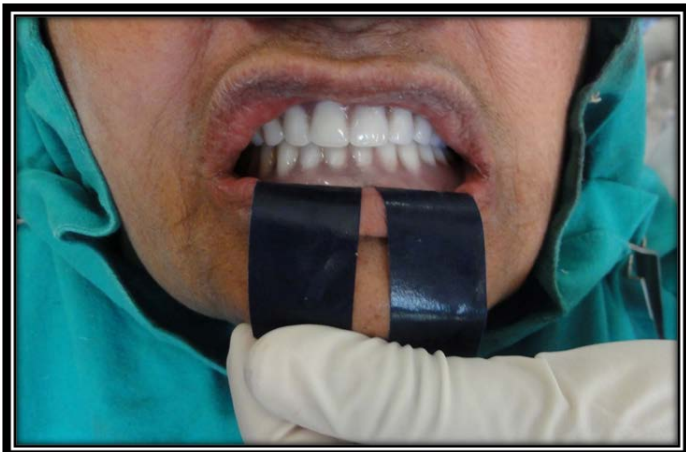
Fig.3: Articulating Paper in Position over Implants