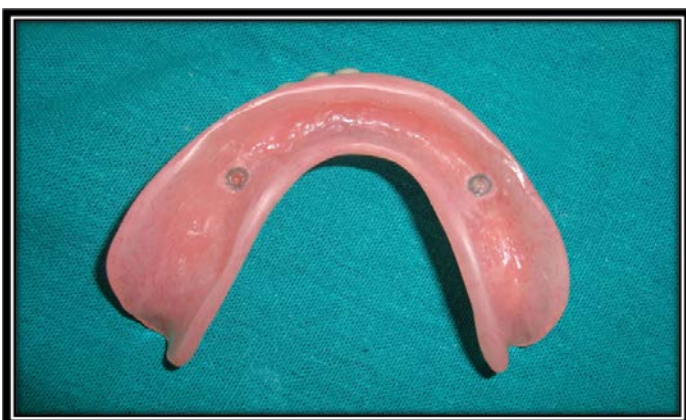
Fig. 5: Nylon Caps acrylated in Mandibular complete Denture