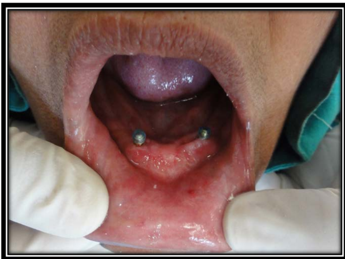
Fig.4: Nylon Caps Placed Over Ball Part of Implants