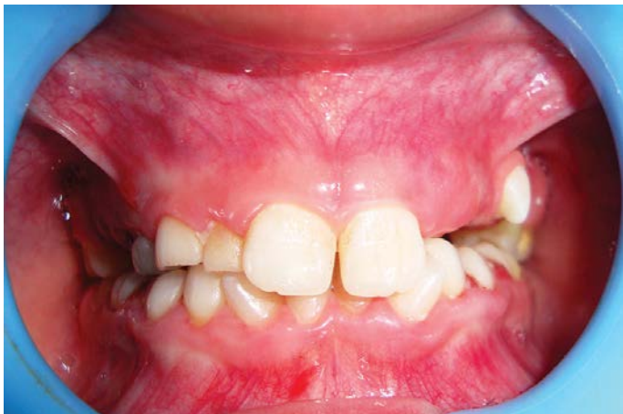
Figure 6: Post treatment photograph