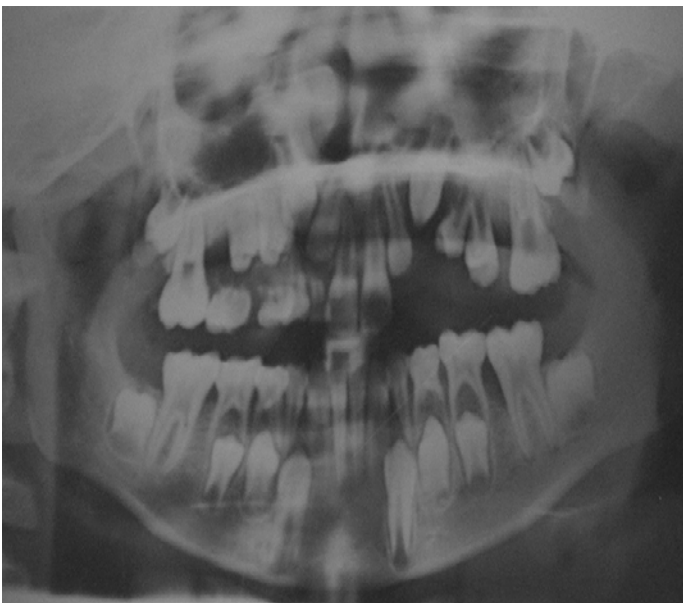
Figure 3: Orthopantomogram of a patient showing mixed stage of dentition, without any abnormality pertaining to the multiple exophytic lesions