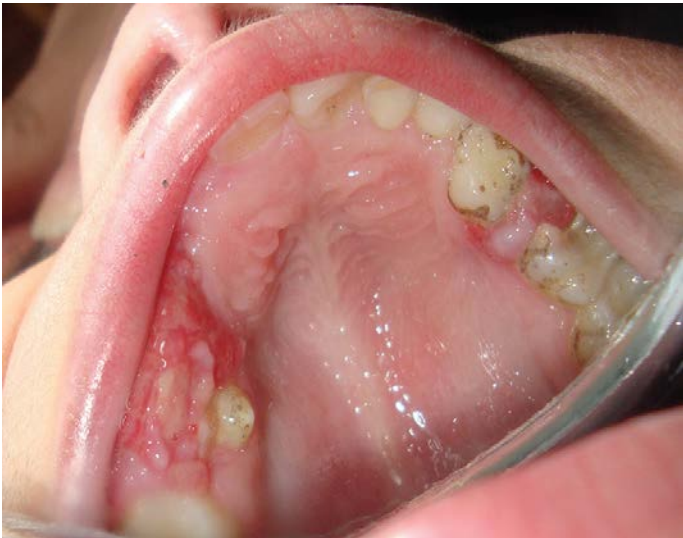
Figure 2: Occlusal clinical view of the lesions showing their expansile nature