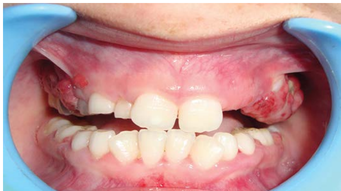
Figure 1: Multiple oral lesions of peripheral ossifying fibroma in both the maxilla as well as the mandible

and the number of missing teeth with associated periodontal ligament.[1,23] Despite reports of POF in children with deciduous or mixed dentition, little data is available regarding the specific occurrence of this lesion, with involvement of the deciduous dentition. The literature also reflects the association of natal teeth with the peripheral ossifying fibroma.[24] Defective odontogenesis and/or retarded eruption of teeth have also been found to be associated with similar histological features in the dental follicles.[25] Ossifying fibromas may be clinically and radiographically impossible to separate from cementifying fibromas.[26] Much of the research study has been carried out to distinguish ossifying fibromas from cementifying fibromas, by using immunohistochemical analysis for keratin sulfate and chondroitin-4 sulfate, in which the cementifying fibromas show significant immunoreactivity for keratin sulfate and the ossifying fibromas show intensive immunostaining for chondroitin-4 sulfate.[27] Such lesions may be present for a number of months to years before excision, depending on the degree of ulceration, discomfort, and interference with function.[4,18]The present study evaluated the occurrence of POF in a Kashmiri population, further studies are needed to evaluate the condition in the current population using contemporary gene analysis techniques.