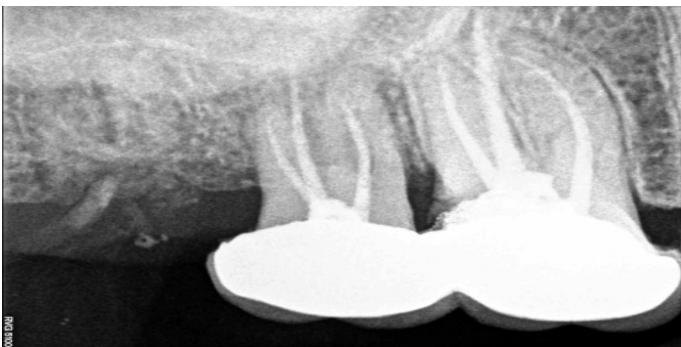
Fig-8- 1 year follow up radiograph

At the 1-year follow-up, radiographic examination revealed healing of the transplanted site (Fig 8) without any signs of root resorption and revealed normal periodontal attachment.