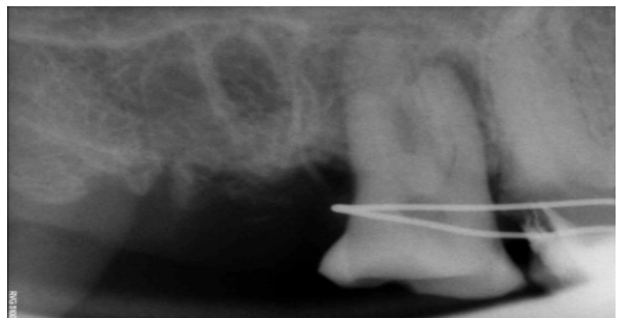
Fig-5- Immediate autotransplantation

Clinical examination after 4 weeks revealed absence of mobility, without any tenderness to percussion or signs of loss of attachment and masticatory ability was normal, splint was removed (Fig 6,7). The root canal treatment for 18 was initiated 4 weeks after transplantation.