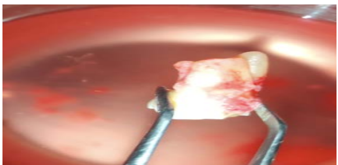
Fig-3- Extracted third molar

Non-rigid intra radicular occlusal splinting with malleable orthodontic wire was done from 15 to 18 (Fig 4,5) to stabilize the transplanted tooth. Tooth was occlusally relieved to fasten healing and prevent trauma to periodontium during healing phase. Patient was instructed to perform daily mouth rinsing with 0.12% Chlorhexidine gluconate.