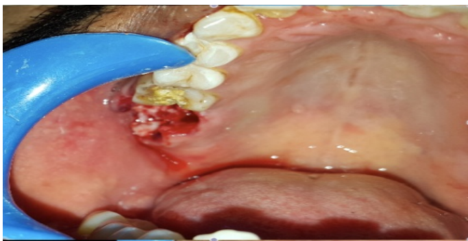
Fig-2- Extraction of tooth 17,18

After explaining the risks and benefits of the procedure to the patient, an informed consent was taken. Patient was prescribed antibiotic coverage one hour before surgery to prevent infection. Taking into consideration socio economic status of the patient, 17 was planned for extraction and root canal treatment for 16. The mesiodistal dimensions of 17 and 18 were suitable for transplantation. Teeth 17 and 18 were extracted atraumatically (Fig 2) without damaging the