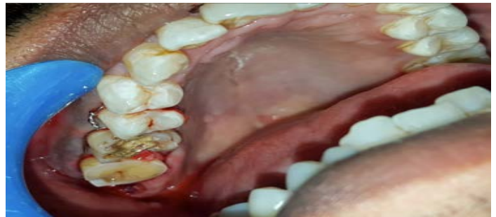
Fig-4- Intra-oral image showing autotransplantation and splinting

Non-rigid intra radicular occlusal splinting with malleable orthodontic wire was done from 15 to 18 (Fig 4,5) to stabilize the transplanted tooth. Tooth was occlusally relieved to fasten healing and prevent trauma to periodontium during healing phase. Patient was instructed to perform daily mouth rinsing with 0.12% Chlorhexidine gluconate.