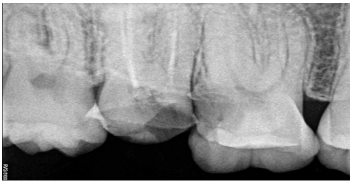
Fig-1- Pre-operative RVG

Normalised Ratio (INR) was done for checking any bleeding disorders.