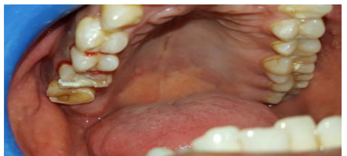
Fig-6 - 1 month post operative photograph

Clinical examination after 4 weeks revealed absence of mobility, without any tenderness to percussion or signs of loss of attachment and masticatory ability was normal, splint was removed (Fig 6,7). The root canal treatment for 18 was initiated 4 weeks after transplantation.