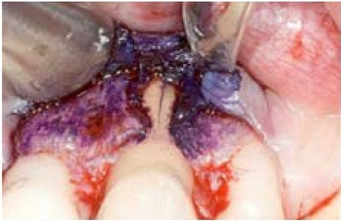
Figure 11: Surgical Assesment