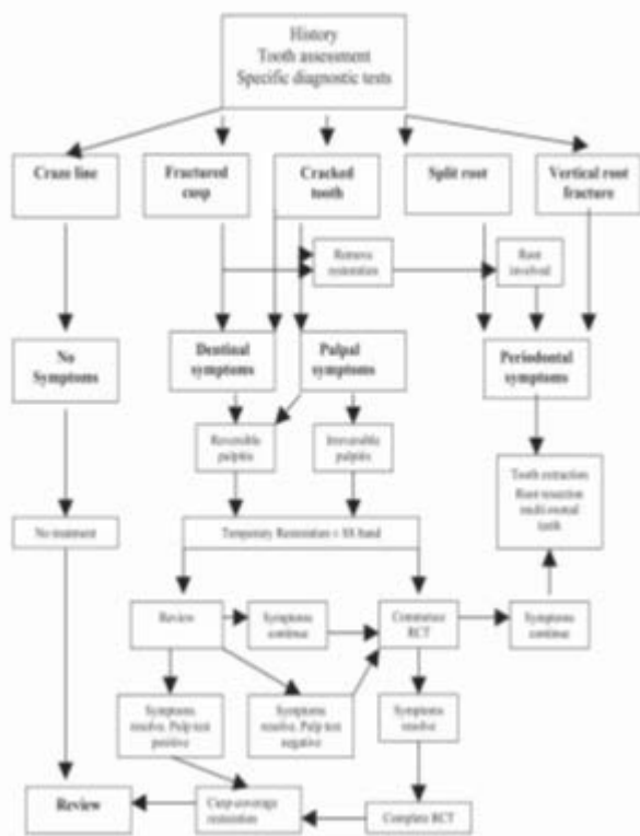
Adapted from Abbott ®