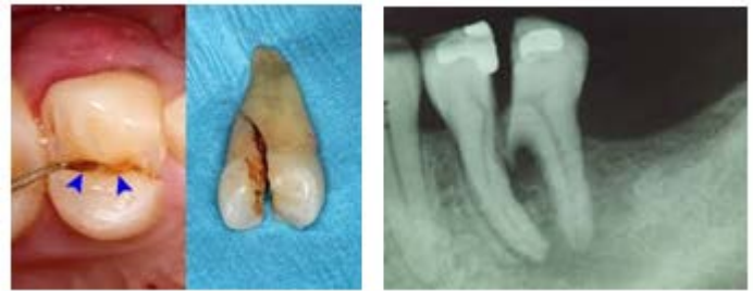
Figure 4: Split tooth

tooth this entity is the result of crack propagation of a cracked tooth. (3,7,8)