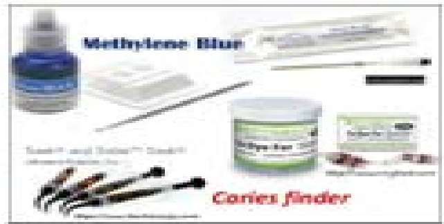
Figure 8: Dye

Cracks may be disclosed through staining. A dye, such as Gentian Violet or methylene blue stains can be applied to the external tooth surface, in the cavity after restoration removal or on a surgically exposed root which highlight fracture lines. The disadvantage of this technique is that it takes at least 2–5 days to be effective and may require placement of a provisional restoration. Placing a provisional restoration undermines the structural integrity of the tooth and further propagates the crack. An additional disadvantage is that a definitive esthetic restoration cannot be obtained. (20)