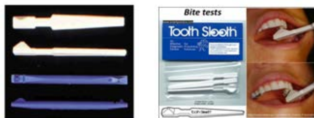
Figure 6: Tooth slooth

Other commercially available tools are “ Fractfinder ” and “ Tooth Slooth II ”. Ehrman et al. have advocated the use of this method as one with a higher level of sensitivity than that associated with the use of wood sticks. This helps in accurate identification of the involved cusp. The Fractfinder or Tooth slooth can be used on each individual cusp and the patient is asked to bite, thus allowing the placement of selective pressure on one cusp. If there is pain on biting or release of biting pressure, it is indicative that the cusp is cracked. (3,6,18)