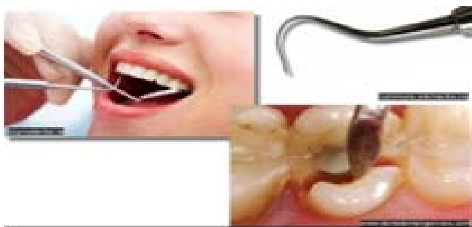
Figure 5: Tactile examination

Scratch the surface of the tooth with the tip of a sharp explorer; the tip may catch in a crack. Palpate the gingiva around the tooth, checking for possible evidence of an underlying dehiscence or fenestration. (3,6)