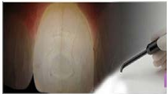
Figure 10: Transillumination

In transillumination, a fiberoptic transilluminator or other similar light source (i.e., fiber-optic handpiece without water or a curing light) is applied directly to the tooth surface. All other light sources are eliminated, the tooth is viewed in a mirror and the light beam is positioned perpendicular to the plane of the suspected crack. A crack will block the light. Structurally sound teeth, including those with craze lines, will transmit the light throughout the tooth structure. A crack that penetrates into the dentin of the tooth will cause a disruption in the light transmission under these circumstances. Transillumination is probably the most common modality for traditional crack diagnosis. There are two drawbacks to using transillumination without magnification. First, transillumination dramatizes all cracks to the point that craze lines appear as structural cracks. Second, subtle color changes are rendered invisible. Transillumination with a fiber-optic light and use of magnification will aid in visualization of a crack. (5)