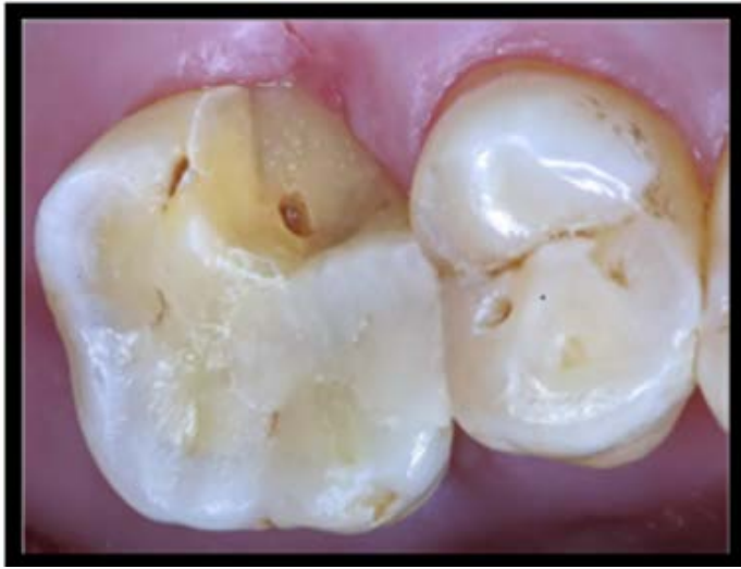
Figure 2: fracture cusps

marginal ridges as well as a buccal or lingual groove and terminates in the cervical region either parallel to the gingival margin or slightly subgingival.( figure 1.2). (3,7,8)