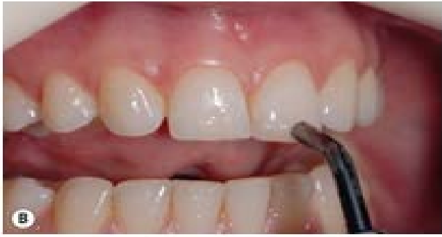
Figure 7: vitality Test

to the pulp may allow bacterial contamination, which probably affects the pulp status. (3)