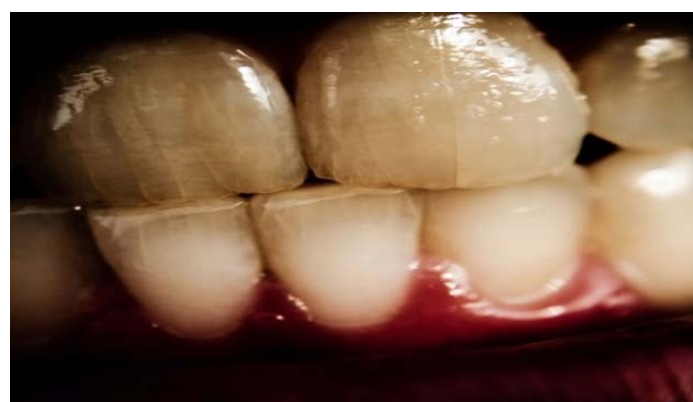
Figure 1: Craze line

Craze lines are found in the majority of adult teeth and only involve enamel. In posterior teeth, craze lines are normally visible crossing marginal ridges and /or extending along buccal and lingual surfaces. Long verical craze lines are often found in anterior teeth (figure A). (3,7) As they only affect the enamel, they cause no pain and are of no concern beyond the aesthetic.on the examination of teeth for cracks,it is observed that most adult teeth have craze lines. (8)