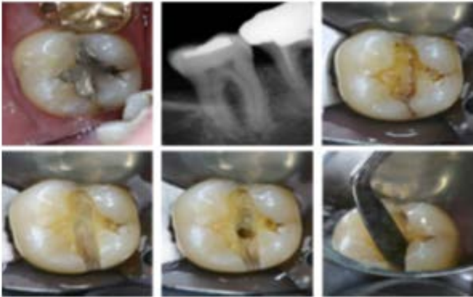
Figure 9: Wedging technique

certainly the tooth is predisposed to a later split anyway; the patient is best served to know this expeditiously. (19)