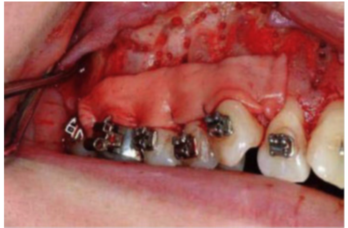
Figure 4 Soft tissue graft (acellular dermal matrix allograft in this case) can be used simultaneously with corticotomy to treat recession.

Bone graft materials [Autograft, mix of Autograft + Allograft, Allograft + Xenograft, or Xenograft + Alloplast] are then placed over the decorticated areas ( Fig. 3a and b ). Antibiotics can be mixed with bone graft. Wilcko et al. recommended the use of mix of demineralized freeze-dried bone and bovine bone with clindamycin. Care should be taken not to place an excessive amount of bone graft which might interfere with flap placement. If there is any recession in the teeth, it can be treated at the same time with connective tissue graft or acellular dermal matrix allograft (AlloDerm) ( Fig. 4 ).