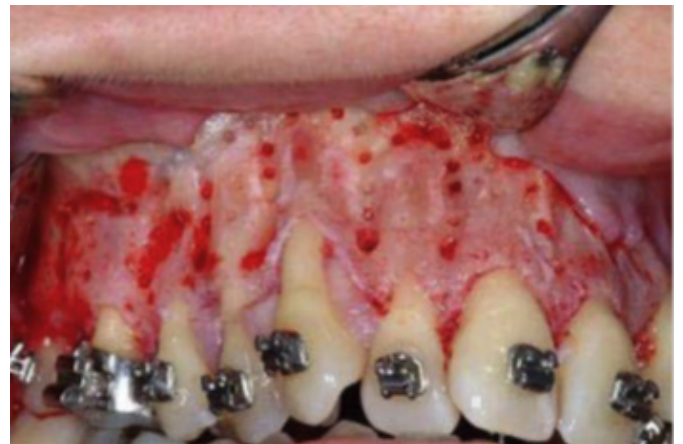
Figure 2: Vertical corticotomy cuts are made between the roots stopping just short of alveolar crest. The cuts are connected beyond the apices of the teeth with scalloped horizontal cuts and cortical perforations are made at selective areas.