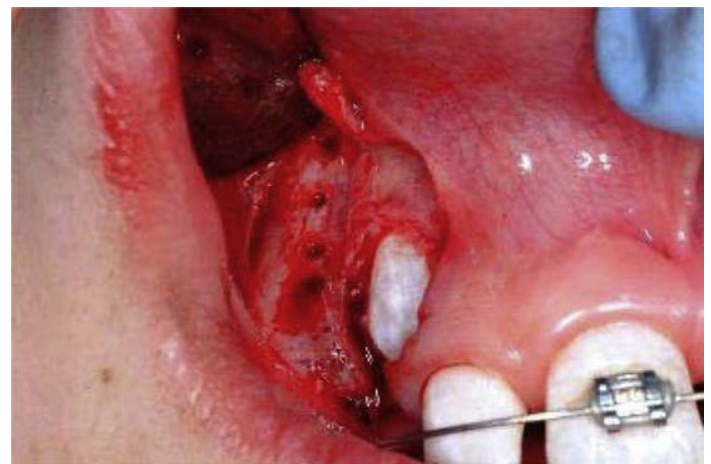
Figure 5: Corticotomy can be used to expedite the movement of individual teeth (impacted canine in this case).